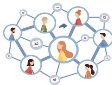
series 'Texts to Share'