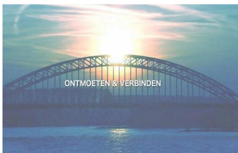
series 'Meeting spiritual Worldviews'